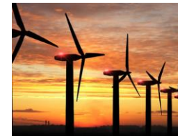
Enabling renewable power generation