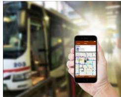
Efficient and accessible public transportation