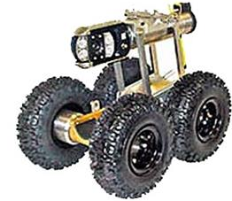
Safe water and sewage lines (reduced leakage)