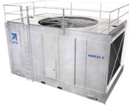
High Efficiency Water Cooling Towers (lower energy usage)