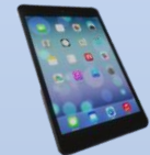
100% digital by 2023