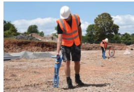
Safe underground infrastructure